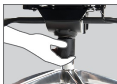
Weight Tension Control